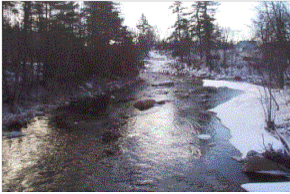
Figure 5-3. Swift River