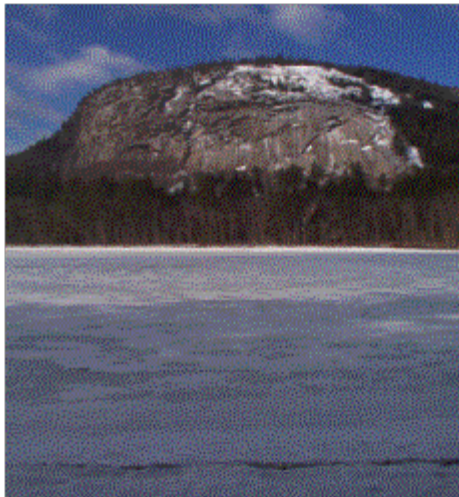
Figure 5-4. White Horse Ledge and Echo Lake